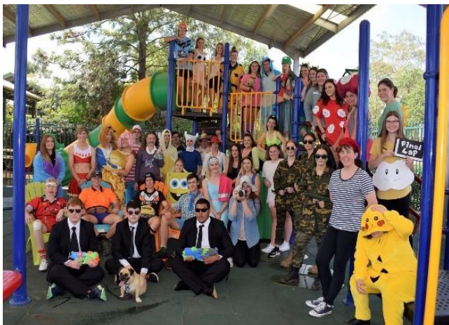
Above: Year 12 Dress up photo